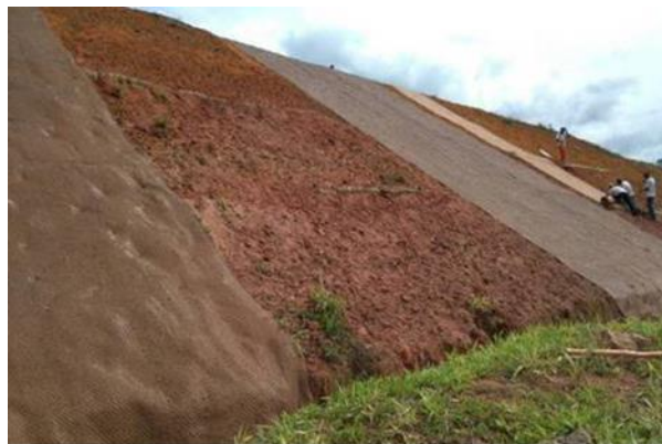
Figure 1. Contiguous execution of the bio-technical systems along with the experimental facilities.